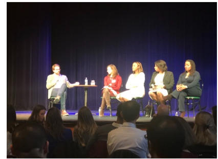
Attending IndyHub's Shape Our City Summit, bringing the topics of recycling and the circular economy to the discussion of how Indiana & Indianapolis can attract & retain young professionals.