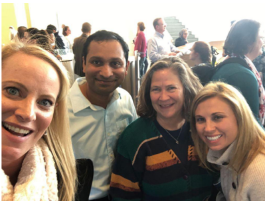
With my favorite Cummins employees at the Cummins PLANET 2050 sustainability strategy unveiling on America Recycles Day!