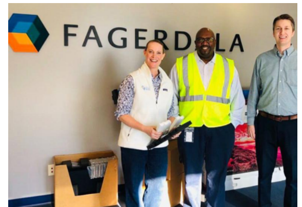
Touring the Fagerdala & Sealed Air facility in Plainfield.