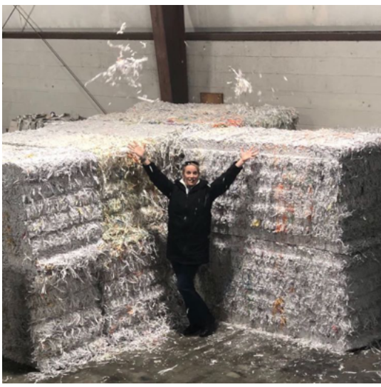
In Jasper, creating my own snow globe with shredded office paper at Kimball International's Corporate Recycling Center!