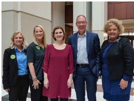
Speaking at IDEM's America Recycles Day event at the Indiana Government Center.