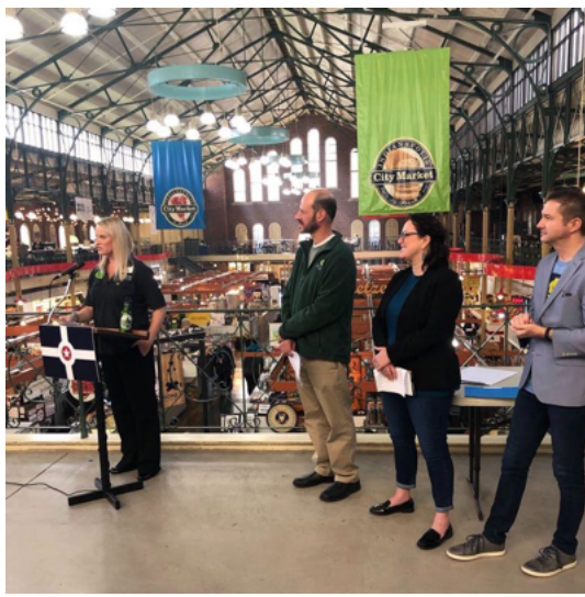
Speaking at IRC's America Recycles Day event, cohosted by the City of Indianapolis and Keep Indianapolis Beautiful, at City Market