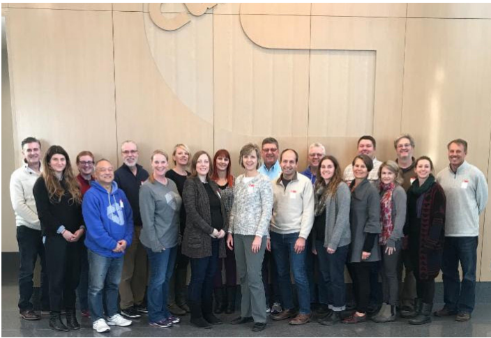
IRC Staff & Board at the 2018 Strategic Planning Retreat