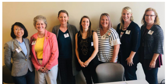
In Lafayette for the WHIN Partner Kickoff