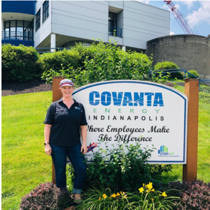
Touring Covanta in Indianapolis