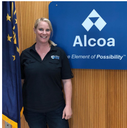
Touring Alcoa's Warrick Operations