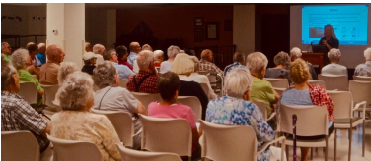
Sharing about the IRC and the circular economy at Robin Run